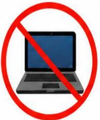
Laptops / Computers