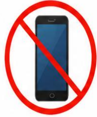
Mobile Phones / Smartphones