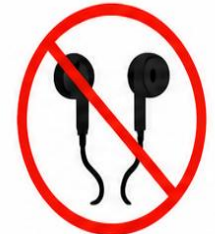
Earphones / Headsets