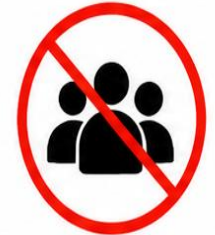
Devices of Parents, Guardians, Friends, or Other Visitors